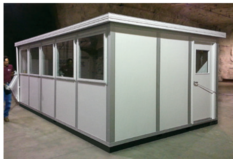
Oversized 12x20' exterior building shown. All Booths under 8x20' are shipped at standard rates.

InPlant's Booths, Guard Shacks, Control Rooms, Operator Cabs and Security Shelters are prefabricated in the factory, wired fully assembled. They are designed for easy shipping – all Booths under 8' by 20' ship at standard rates. Larger Booths require